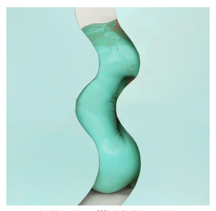
Lee Materazzi, ~~~, 2021, Archival pigment print. Image Courtesy of the artist and Quint Gallery

Lee Materazzi: Roughly Cut a Smooth Curved Line